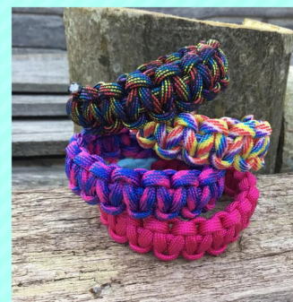
Free thanks to Laura Turner Dugas Foundation Grant